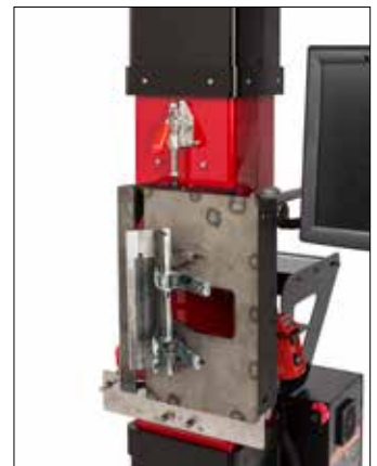
Table Position 3 Position: Vertical