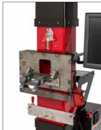
Table Position 2 Position: Overhead