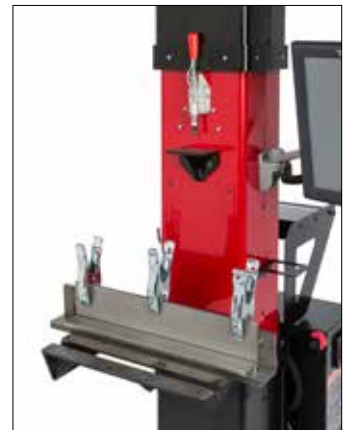
Table Position 1 Position: Horizontal