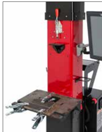
Table Position 1 Position: Flat

REALWELD Trainer teaches multiple welding processes in a number of welding positions (1F, 2F, 3F, 4F, 1G, 2G, 3G) and joints (lap, tee, groove, flat plate).